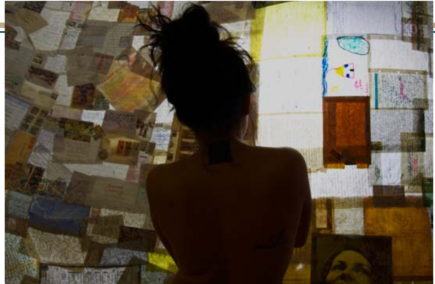
Elements of Devotion , performance art, 2013

Analysis of Death through Material uses the concept of M▲teri▲l=ism through the display of work that shows death in different definition and parts of life. Throughout the work, everyday material is stripped from its original definition and significance and is transformed into texture, color and shapes. This allows the viewer to get lost in the work and no longer see individual objects, but instead feel the work engulf them. The space provided within the work forces the audience to explore the dimensions of the piece from within. They are able to reflect on their own personal feelings towards death, all the while gaining my personal perspective on the subject.