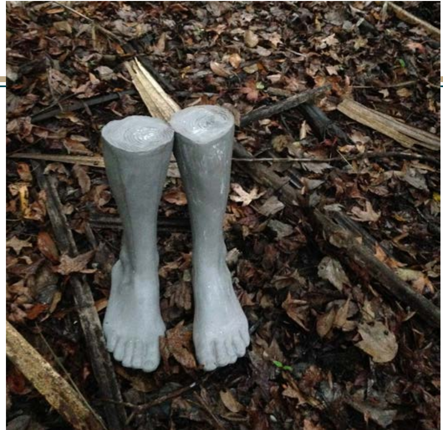
Recomposed (detail), clay sculpture, 2014

Matter exists endlessly in infinite combinations. Natural cycles of dispersal and reformation of matter defy human ideals of permanence, which we struggle with as living things intimately aware of our own imminent decomposition. In death we become something else: a meal, a monument, soil that will host new life. The clay in these sculptures has been mined from the earth and recomposed into the form of feet. They are tree stumps in the swamp; ready for their own decomposition. Soon the clay will deteriorate away from this human-tree hybrid form. The feet have been submitted to various environments to begin their decay before exhibition. The industrial grey sculptures are filled with organic elements visually bridging the gap between man-made and natural. Everything we are or ever make will eventually meet the same process of deterioration and decomposition. After the exhibit ends, my unfired and fragile clay feet will be placed back into the environment and decompose quickly. For a while, they will exist only as a discoloration in the swamp before time and weather disperse the clay that was once human feet.