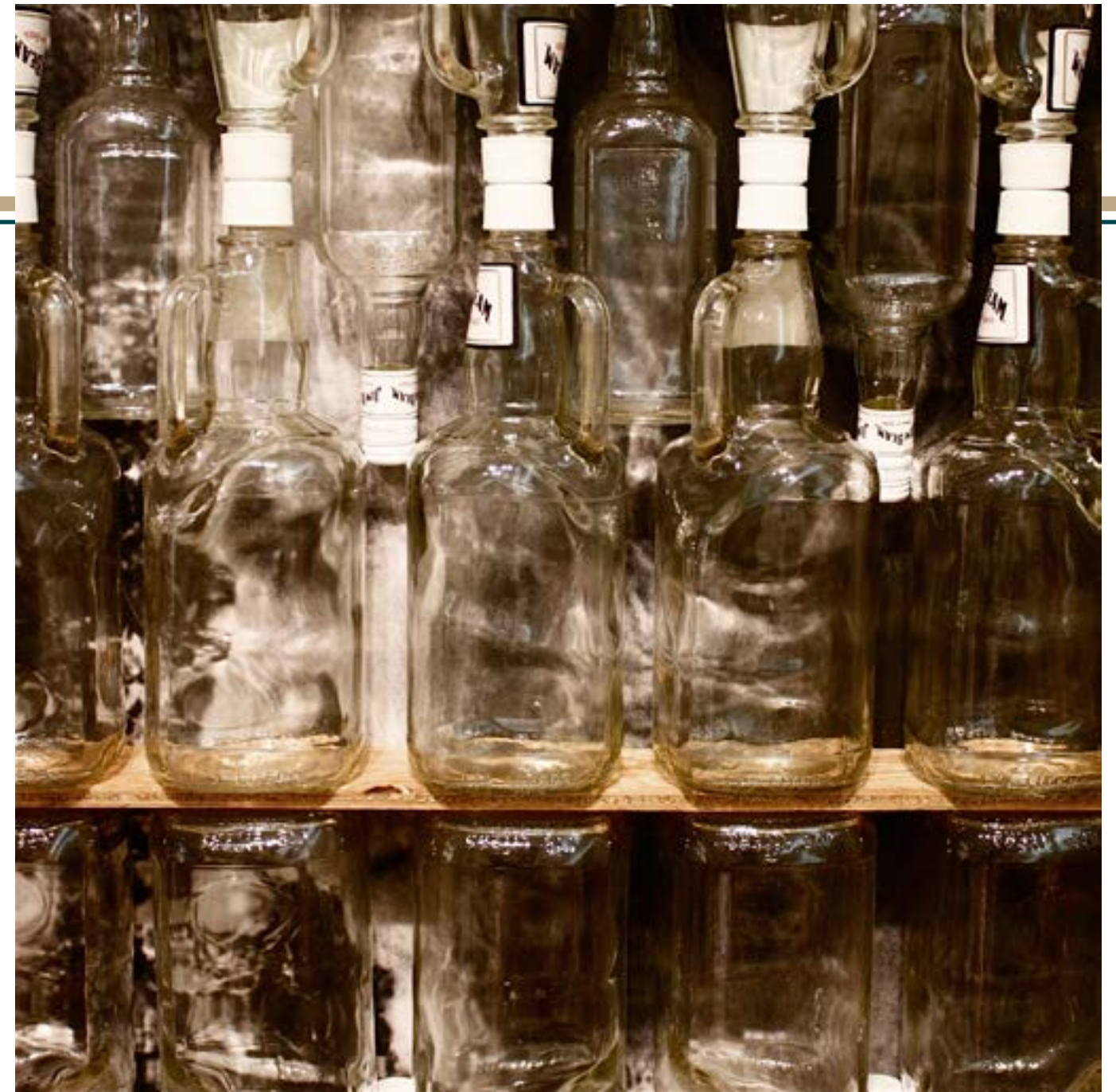
Unsettling Recollection (detail), 44in x 52in, mixed media, 2014

Nostalgic Daze is not meant to be a harsh criticism of his decisions or even an elegy in memorial of his life. Nostalgic Daze is a physical expression of my personal exploration for acceptance and understanding about the death of my father, but my intentions are for the viewers to feel a sense of loss and longing for a person in their own lives, rather than only experiencing my account of an absent father.