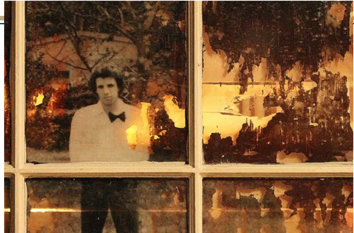
Native Foreigner - A Fragment of My Identity (detail), 8ft x 5ft x 6.5ft, mixed media sculpture, 2014

The use of wood is a reoccurring theme in my work. Rings are exposed when wood is cut. Information is gathered from these rings in the wood, which reveals its history. Wood and I are alike - My history is revealed through the values that I have acquired from my parents.