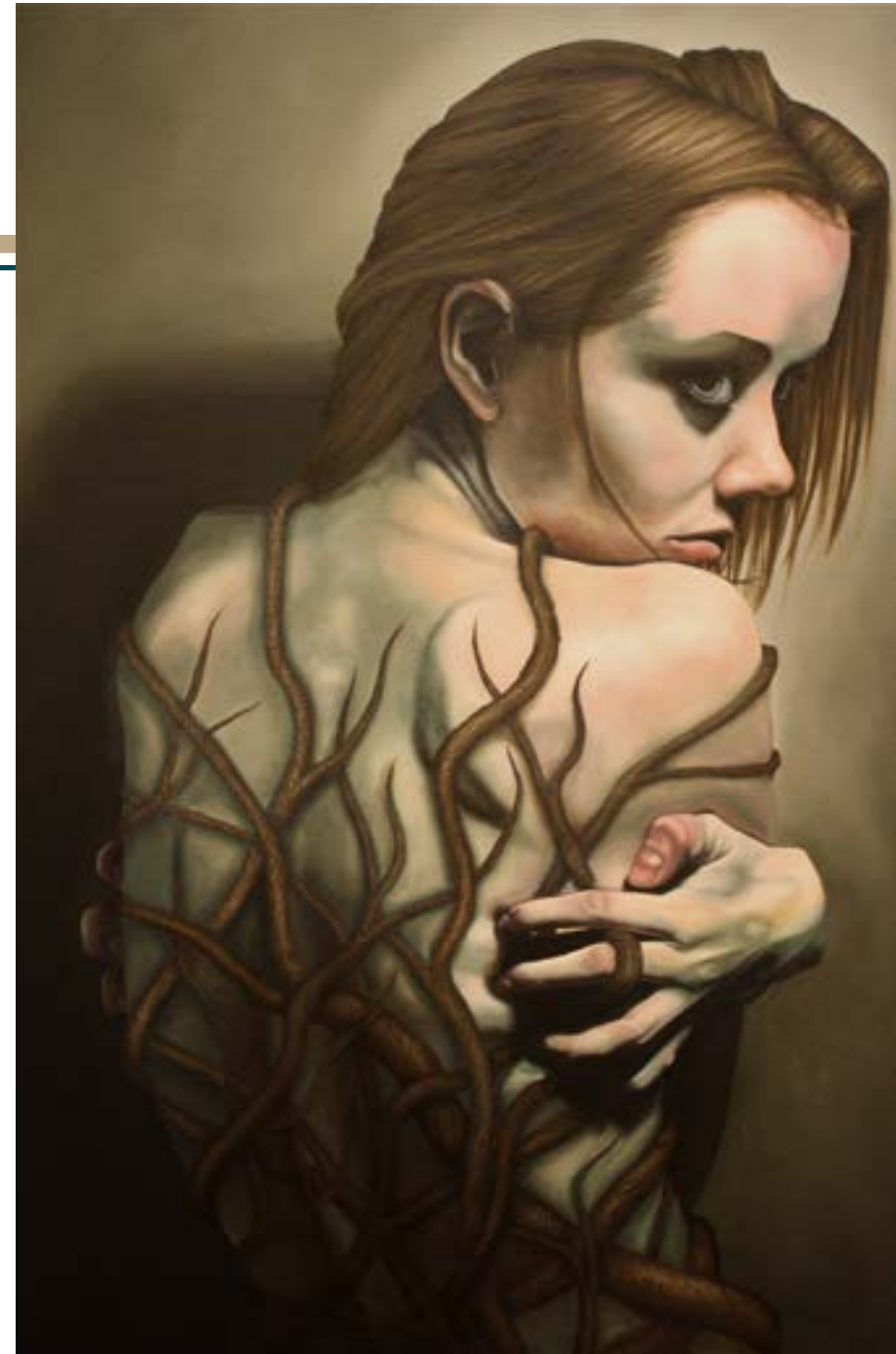
Acrimony , oil on canvas, 36in x 24in, 2014

The parasitic vines represent inner psychological struggles rather than specific imagery. Their dry, cracked appearance evokes an uncomfortable feeling from both a tangible and psychological standpoint. Their relationship to each of the figures is parasitic rather than symbiotic. However, they have found a way to coexist in a way that is not comfortable, but sustainable. I have depicted these vines going through the flesh to show that this affliction stems from both within the body as well as from outside sources. Although the figures appear to be escaping their entanglement, the distant shadow of vines hinders any sense of release.