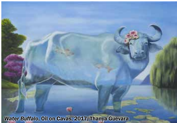
Water Buffalo, Oil on Canvas, 2017, Thanya Guevara