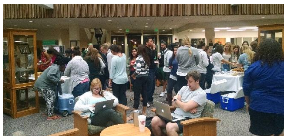
Students Enjoy Cookies & Milk in the Library during Final Exams

The spring semester has ended and the library has gone from a fully packed house during final exams to a much quieter summer mode. But that does not mean we are taking a break! Summers in the library usually involve some type of renovation project that makes our facilities better for our students and faculty. This summer we will be remodeling a portion of the ground floor to provide about 3,000 additional square feet of quiet study space. A generous donor has provided funding to carpet the tile floor, and we will be buying new furniture with funding from the Student Government Association and the John Haire Family Endowment. The area should be ready by the start of classes in August. Library staff will also stay busy planning for the coming academic year - this year we will be focusing on implementing a marketing strategy based on a study done by some of our librarians (read more later in the newsletter). Our students' needs constantly evolve and we do our best to keep up with the facilities, technologies, and collections that they need to be successful learners. If you are in town this summer, stop by the library and say hello. We wish all Hatters a safe and relaxing summer.