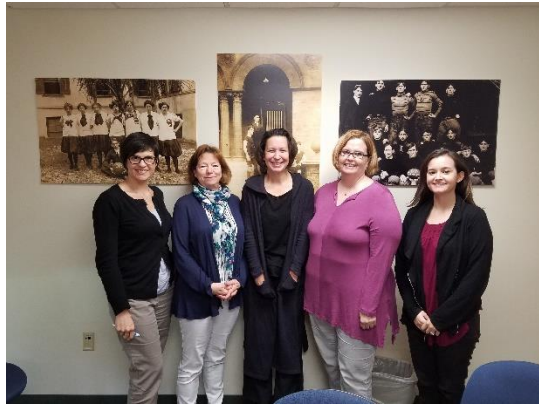
The Library's Marketing Project Team

will present the marketing plan and preliminary data on the impact of the plan at the NEFLIN annual meeting in September.